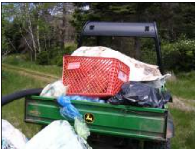
Towers shopping cart recovered from Mauger's Beach

Volunteers this year were hoping to find less sewage-related garbage since two of HRM's new sewage plants are up and running. But, alas, there were still hundreds of plastic tampon applicators strewn about on the beaches of McNabs and Lawlor Islands Provincial Park. Hopefully next year with all the sewage plants up and running, we won't find this eyesore littering the beaches anymore. If only something could be done to filter out those Tim's cups!