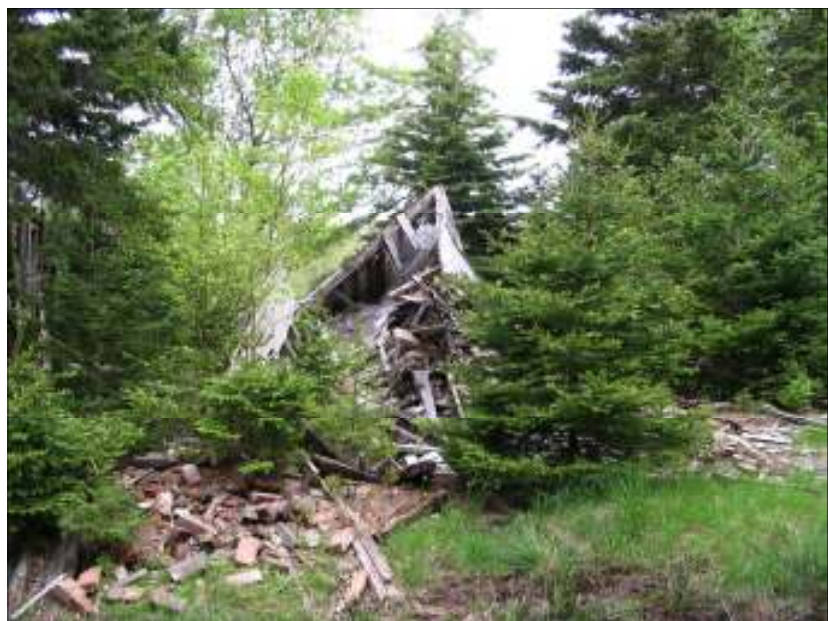
The Findlay-Innis Farmhouse fades into history