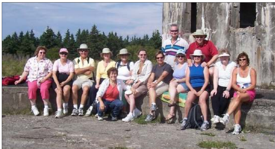
Ski Club 30 tour of Fort McNab

If you are interested in joining the growing list of McNabs Island tour guides, but missed the training session last summer, please contact Carolyn Mont at 477-0187 or carolynmont@ns.sympatico.ca . If there is enough interest, we will organize another training