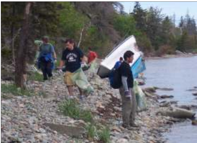
Volunteers cleaning up Back Cove

Cleaning up McNabs and Lawlor Islands has its challenges and its rewards. For the past 18 years, the Friends of McNabs Island have organized beach cleanups of the islands. Thousands of people have given freely of their time to clean up McNabs and Lawlor Islands Provincial Park over the years and we thank them for their efforts. It takes a special kind of person to give back to their community and volunteer their time to clean up someone else's garbage.