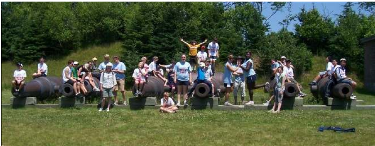
St Mary's Mini University Day Camp at Fort Ives June 2008